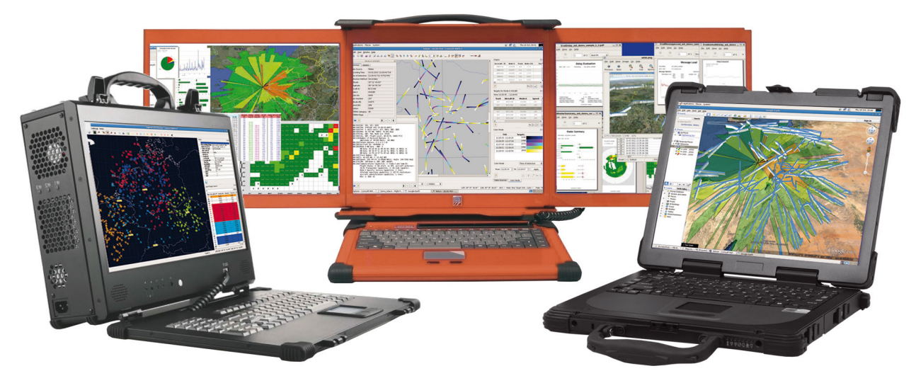
Classic portable PC, ruggedised portable PC, 3xD ruggedised portable solution