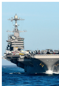
Air marine operations