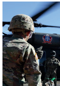
Homeland defense Border security