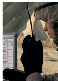
Expeditionary Forces – Command Center C2