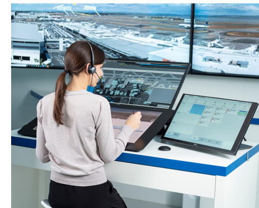
Modern ATC is digital

Delivering mission-critical communication in the ME for over 20 years