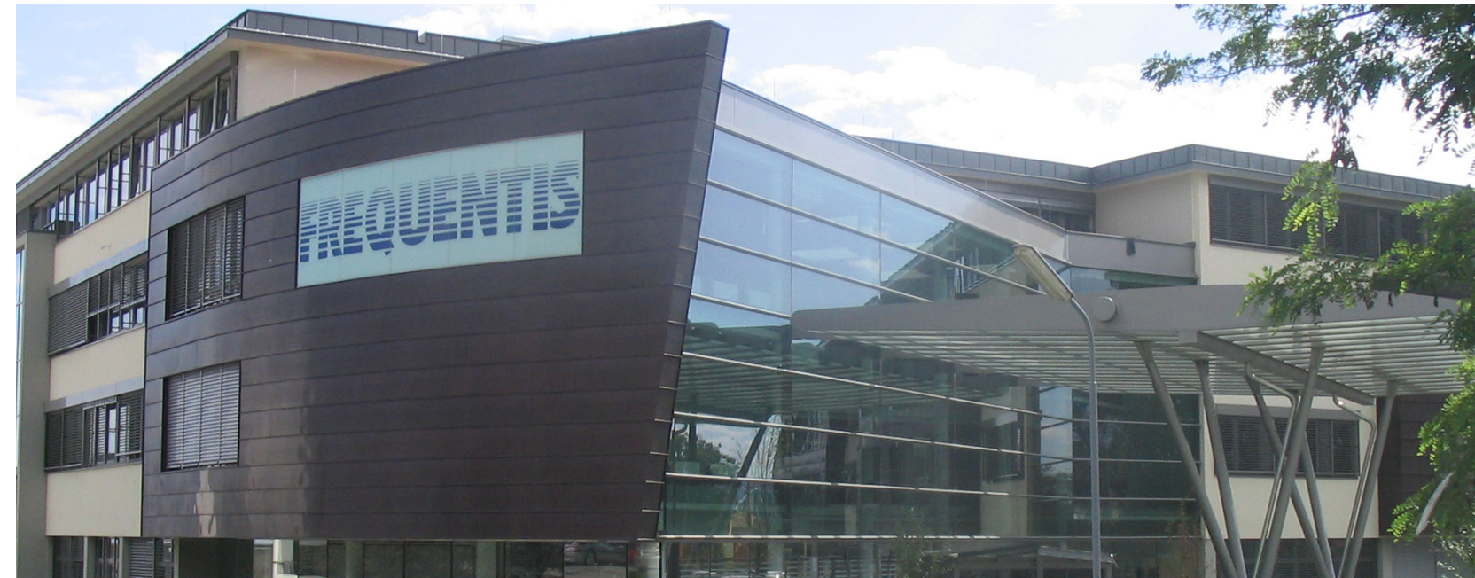
The Vienna HQ supports global offices in over 50 countries

Frequentis has been serving tailor-made solutions to clients throughout the entire Middle East region for over 20 years, supporting many of these expansion projects, including voice communications for over 50 airport systems in the Middle East and 17 air bases and control reporting centres.